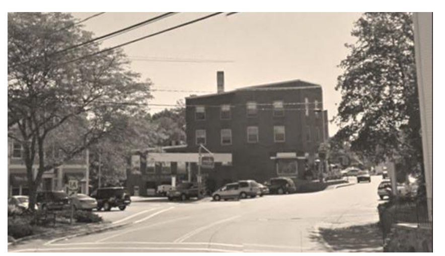
View today in the early 21<sup>st</sup> century. Conditions have continued to evolve with the times, yet the underlying problems, and the concerns they caused, persisted. Now, almost 70 years after the 1946 Improvement Plan, its assessment of the Village as "..... inconvenient, ugly and to a degree dangerous..." remains as appropriate as it was then.