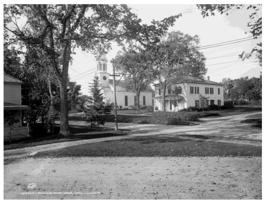
View from the intersection of York St. and Long Sands Rd, the heart of the village and future site of the Monument. Note dirt streets with electric lines. As part of a movement to beautify York, in 1882 First Parish Church was lifted from its foundation, turned perpendicular to York Street, set back twenty feet from the street, and remodeled with a new steeple.