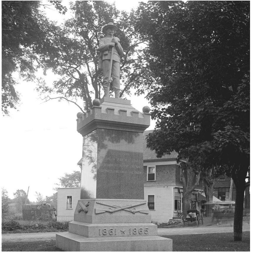
View of the intersection of York St. and Long Sands Rd, with the Monument at the heart of the village. Note dirt streets with a buggy in background, and grass and trees around the Monument.

Prior to 1902, York Street was without shade trees, the old cemetery was overgrown and the "village green"—the area surrounding Town Hall and the First Parish Church—was a sometimes muddy, always unkempt knoll. In 1902 the Improvement Society took it all in hand. A landscape plan for the village green was created, so too for the Civil War monument in the square, trees and flowering shrubs were planted around Town Hall and the church, as well as along York Street and in the cemetery.