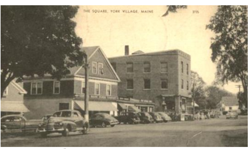
In the early to mid 20<sup>th</sup> century, York's business district, along with the "monument square" at the intersection of York Street and Long Sands Road began to "modernize" and achieve much of its character we recognize today. Power lines and paved asphalt roads for automobiles impacted the historical nature of York Village.